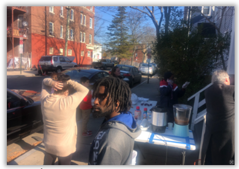
Our 4<sup>th</sup> annual Sidewalk Thanksgiving served 30+ a home-cooked Thanksgiving meal, turkey with the trimmings, apple and pumpkin pies for dessert.