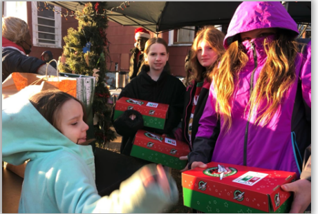
We host a Kids Christmas Eve, with presents, crafts, and a community meal for the kids and their parents—and anyone walking by! A few weeks earlier, the kids make ornaments for an outdoor Christmas tree they decorate. This is hosted late afternoon on Christmas Eve. We had 30 kids (and many parents) this past year.