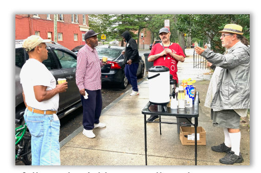
Started a coffee time— Coffee & Conversations —to create a space for street folks and neighbors to talk to the pastor (me!). While we have both women and men stop by, most of my conversations are with the men.