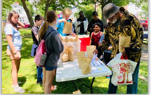
Our Anchor Church teens make and offer a nice bag lunch to our neighbors in Trowbridge Square Park; where we will soon serve a Wednesday evening meal (at our Park BBQ)