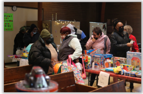
We hosted our 11<sup>th</sup> annual Hill Christmas Store, a partnership between our anchor church and ourselves, providing lowcost kids items for local families.