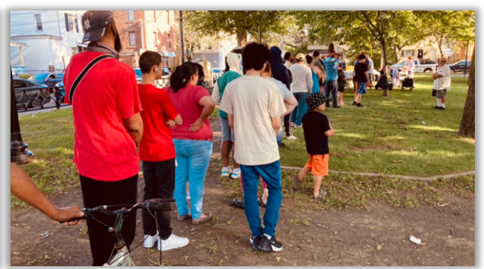
40 to 50 folks would often gather to hear my Park preaching before I pray for the meal.