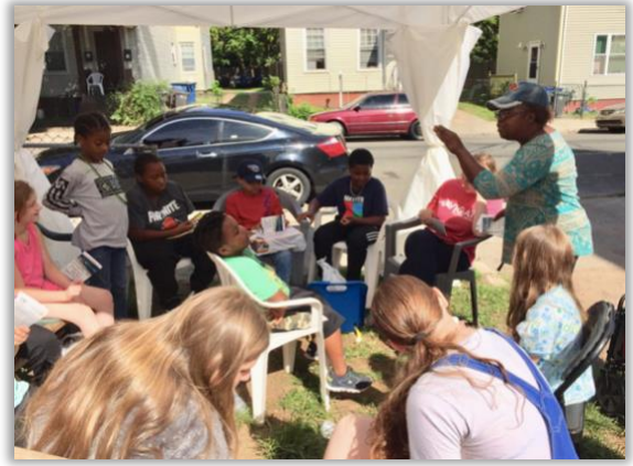
Our Kids' Read Aloud on Stevens Street and Our Carlisle Street Saturday Sidewalk Breakfast & Church Service