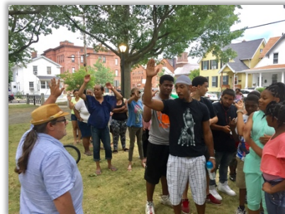
A picture from last year's Park BBQ. We will start July 5 th (after the 4 th of July) with our first summer "In His Midst" BBQ. This year we will be serving over 70+ people each week thanks to our partners.