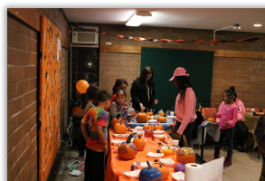
The kids had a great time at the 2017 CPC in The Hill Harvest Party.

In October, we had our first CPC in The Hill Men's meeting. We decided we need to take the time to engage men throughout the Hill—so we passed out flyers for an upcoming, 1-hour Men get together @ 158.