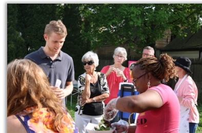
Just like a Wednesday at the park, our CPC in The Hill folks serve up the hot dogs and hamburgers and fixings at our backyard BBQ.