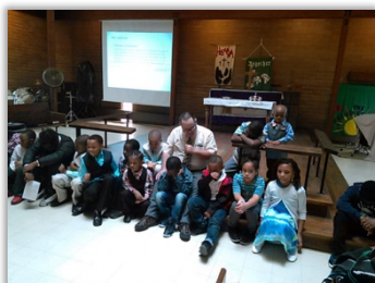
Easter Sunday Children's message—lots of kids hearing the “surprise” of Jesus being alive (again from the grave).