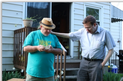
While at our backyard BBQ fundraiser, one of our CPC in The Hill Prayer Partners takes the time to pray for me and the Park BBQ ministry.