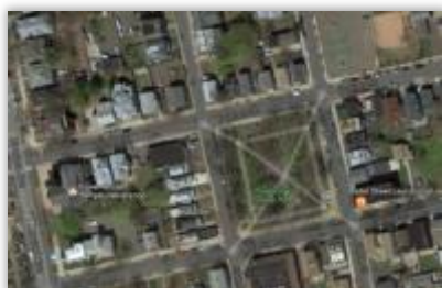
Our “In His Midst” Park BBQ destination in a few weeks: Trowbridge Square Park