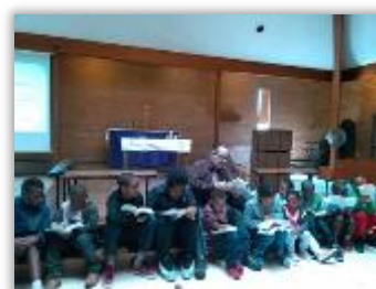
Our Sunday Morning kids looking up their Bible verse of the month: Romans 8:15