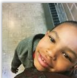
Can't trade away these moments. One of our kids loving on his pastor!