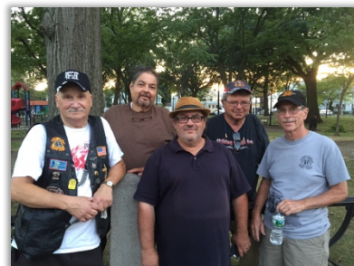
We are privileged to have a number of Christian Bikers join us at our Summer Park BBQ ministries.