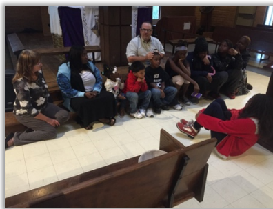
It’s hard to say what’s my favorite part of our worship service, but my time with our children each week is priceless. I am grateful for them.