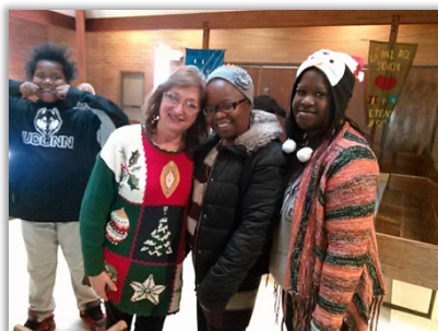
We had a wonderful Christmas morning worship service this year.