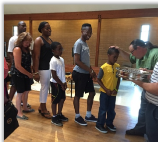
I love praying for our Hill kids and covenant children as we gather at the Table each Sunday.