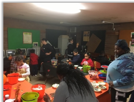
The room was filled with neighborhood families at our annual CPC in The Hill Harvest Party.