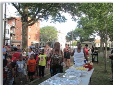
Yes, it's winter, but we're starting to plan for our Spring and Summer BBQ and Park ministries