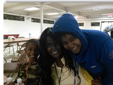
A great family sharing our Thanksgiving meal